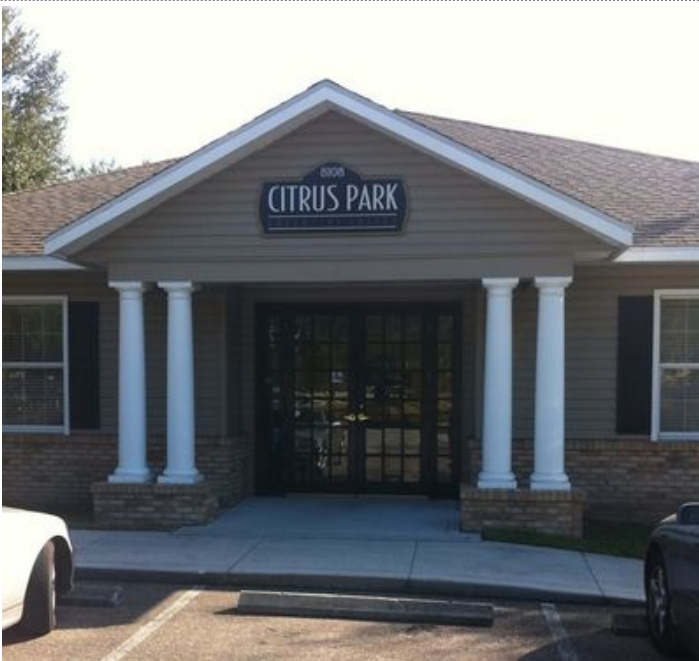
Front Entry Elevation